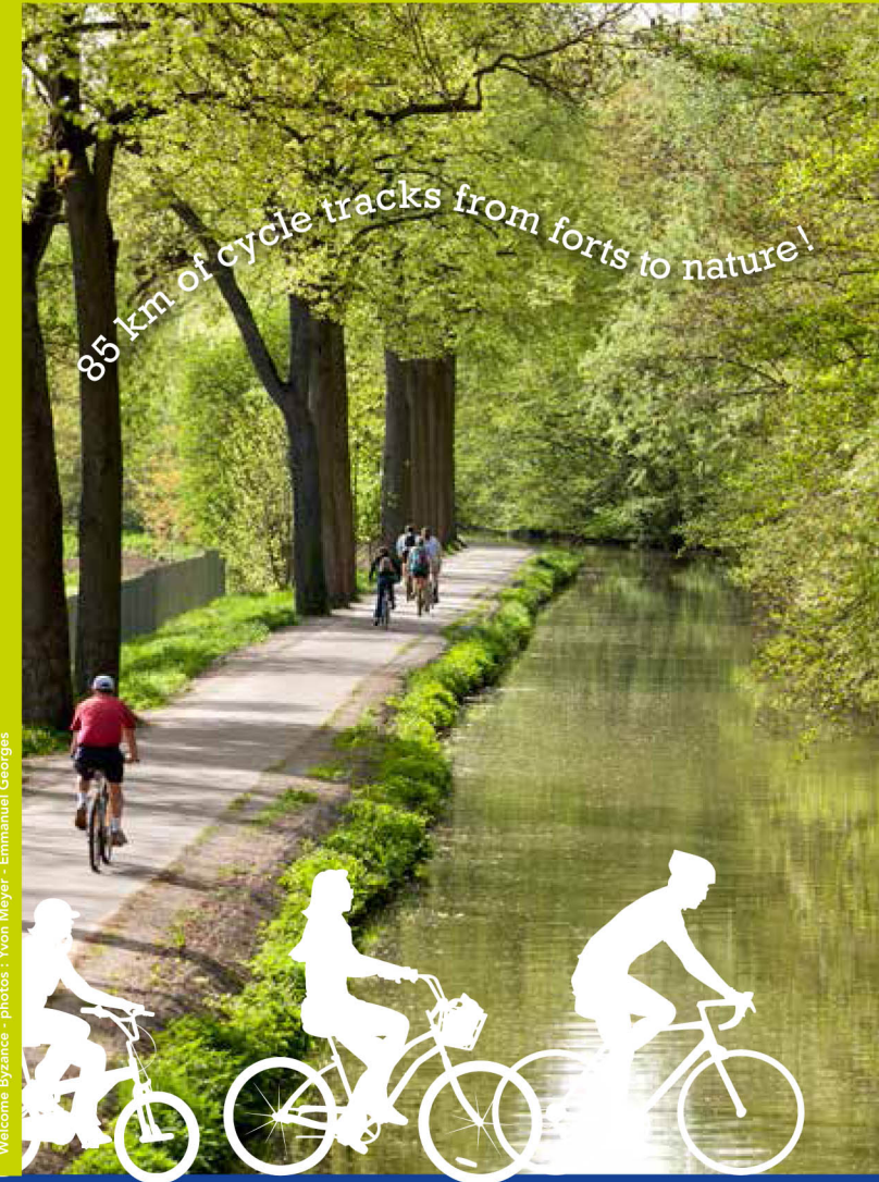
Welcome Byance