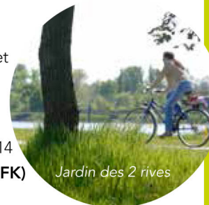
Jardin des 2 rives

Open every day from 2 to 9 pm throughout the summer (until 21 September). Outside the summer months, please contact the Town Hall. The municipality reserves the right to close the site for safety reasons or due to poor weather conditions.